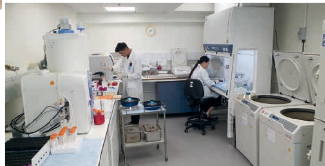
T 座教學設施及實驗室 Teaching facilities and laboratories at Block T