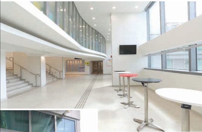
T 座 2 樓中庭 Atrium, 2/F, Block T