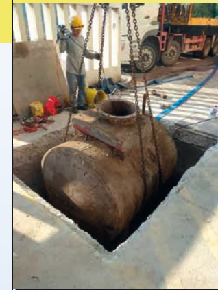
地底油缸拆卸工程 Decommissioning of underground oil tank