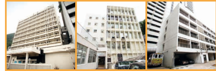
臨床病理大樓 (左)、病理學樓 (中) 及醫生宿舍 (右) 將於今年第四季進行拆卸，並於原址興建新大樓。 Clinical Pathology Building (Left), Pathology Building (Middle) and Housemen Quarters (Right) are scheduled to be demolished in the fourth quarter of this year for construction of a new block.

Redevelopment of QMH, phase 1 – main works has sought funding approval by the Finance Committee (FC) of Legislative Council on 18 May 2018. The construction works is scheduled to commence in the fourth quarter of 2018 for completion in 2024.