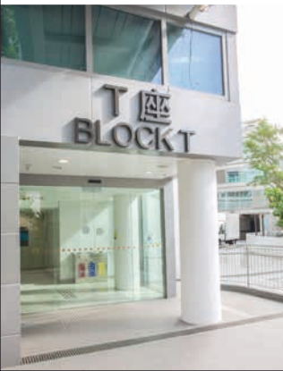
T 座 Block T